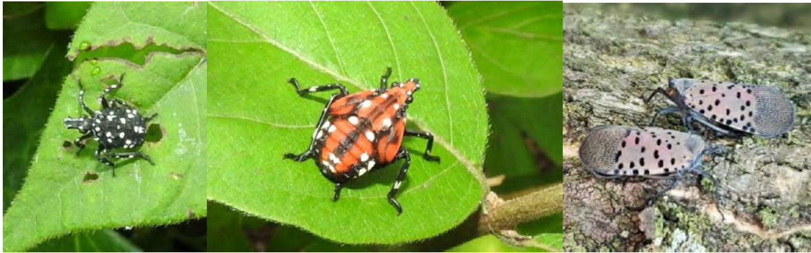
Photos: Early and fourth instar nymphs, and adults of spotted lanternfly.

A new insect pest, spotted lanternfly (SLF), has entered the Southeastern region. This insect is spreading through Virginia and has been found in two counties in North Carolina to date. SLF is in the planthopper family, and all stages are active jumpers. SLF has a broad host range. While grape is by far the most vulnerable crop, SLF feeds on more than 70 species. The early instars (nymphal stages) are black with white spots. These are the stages most likely to be found on strawberry. Fourth instar nymphs are bright red with black and white markings. Adults have pinkish grey front wings with black spots. The pink cast is due to the bright red hind wings showing through the front wings. Evidence of feeding includes accumulation of honeydew on leaf surfaces, supporting the growth of black sooty mold. Nymphs can be controlled by many insecticides that are used for other early-season grape pests, e.g. bifenthrin, fenpropathrin and carbaryl. In crops where adults are the main problem (late season), continued re-immigration is a significant problem. Risk may be higher if plantings are near stands of tree-of-heaven, a key host tree. More information on SLF can be found at https://www.virginiafruit.ento.vt.edu/SLF.html , and in a recent issue of Small Fruit News, https://smallfruits.org/2020/04/spotted-lanternfly-watch-for-a-new-invasive-pest/?cat=19 (note the distribution map in the SFN article is now outdated!).