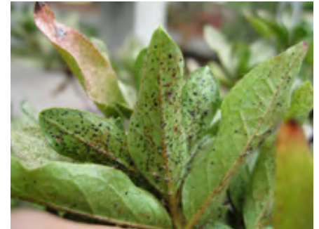
Fig. 7. Frass spots and cast skins help identify lace bug damage.