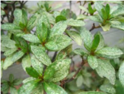
Fig. 5. Azalea lace bug damage on azaleas.

Lace bugs also attack a wide range of deciduous trees and shrubs. Plants found in the Georgia landscape that are commonly infested include hawthorn, cotoneaster, quince, American elm, apple, sycamore, oak and cherry. Recently, significant lace bug damage was observed on ornamental grasses, which are common in southern U.S. landscapes.