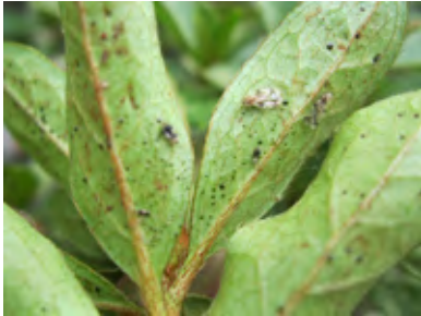
Fig. 1. Azalea lace bug, Stephanitis pyrioides, adults.