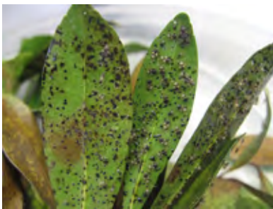
Fig. 2. Andromeda lace bug, Stephanitis takeayi , nymphs and adults.

Lace bugs are important pests of many ornamental trees and shrubs. They attack a broad range of evergreen and deciduous trees and shrubs and often go undetected until the infested plants show severe damage.