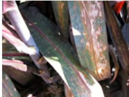
Fig. 6. Grass lace bug damage on ornamental grasses.