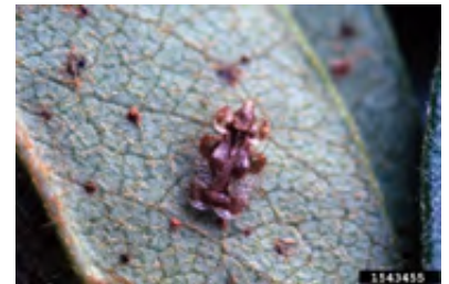
Fig. 3. Hawthorn lace bug, Corythucha cydoniae , adult.

Lace bugs in the genus Corythucha (hawthorn lace bug) and Leptodictya (grass lace bug) differ from Stephanitis species in that they spend the winter as adults on or near their hosts in bark crevices, mulch, tufts of grass or similarly protected areas. Spring-generation eggs are laid in small groups on the lower surface of leaves. Development from egg to adult may require four to seven weeks depending on species and climatic conditions. Three to four generations can occur in Georgia during the growing season.