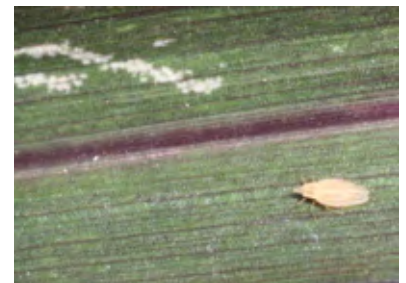
Fig. 4. Grass lace bug, Leptodictya plana , adult.