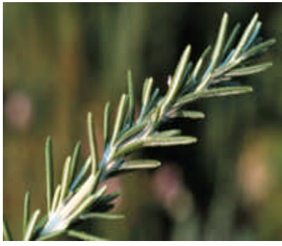
Sprig of Rosemary