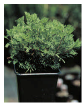
Artemisia abrotanum Southernwood