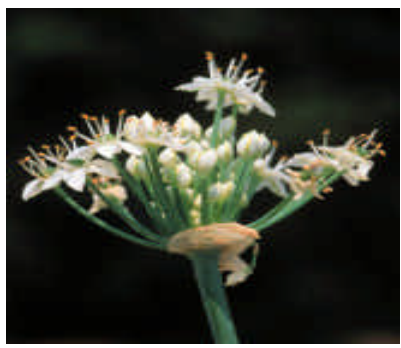
Garlic Chive flower