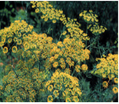
Dill in flower