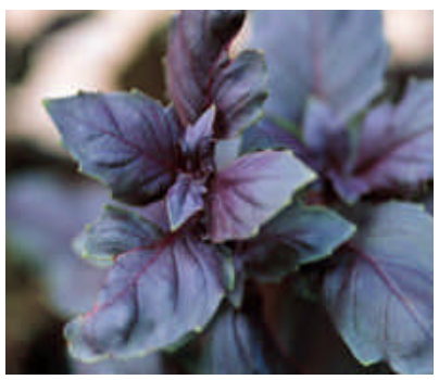
Basil Dark Opal