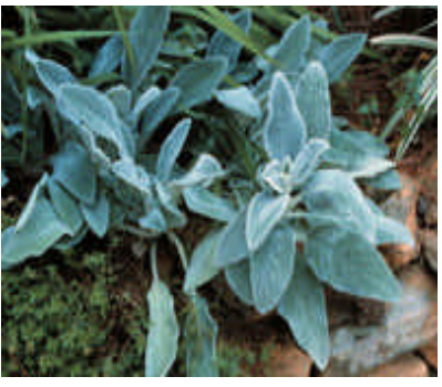
Stachys, or Lamb s Ear