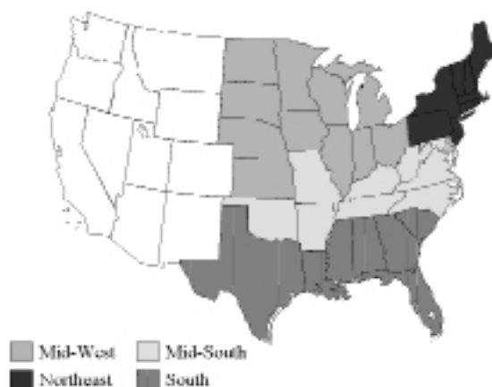
Figure 1. Map of United States showing four regions.

Herd Summary information was obtained from the DRMS, Raleigh, North Carolina, for Holstein herds last tested in November or December, 2000. Research has shown that management variables may differ by region of the country, herd size and milk production level. Consequently, benchmark values are presented for Northeast, Midsouth, Midwest and South regions (Figure 1). Within regions, values are further subdivided by either herd size or rolling herd average milk production. Values in all tables and graphs were limited to herds with a minimum of 25 cows. Minimum rolling herd milk production for herds included in percentile tables was 12,000 pounds. Note that all analyses and calculations are based on herd average information and not on individual cow data.