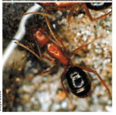
Figure 2. In Georgia, the black carpenter ant (top) is more common than the Florida carpenter ant (bottom).