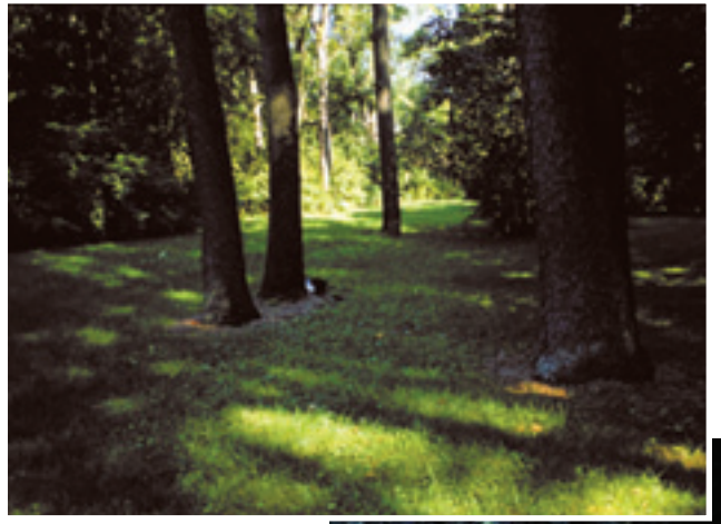
Figure 4. Carpenter ant habitat are those areas abundant in hardwood trees. These areas are typified by older, suburban neighborhoods where large trees are abundant and water rarely limits colony growth and survival.

BIOLOGY In Georgia, carpenter ants become active in the spring (March/April) and remain active through the early fall (September/October). During the winter, ants become inactive and hibernate in their nest to survive the cold. The habitat where carpenter ants are most common are