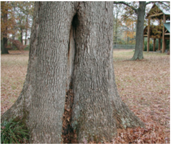
Figure 9. Outdoors, the most common nest site of black carpenter ants is in hardwood trees containing one or more treeholes.

Outdoors, black carpenter ant nests are found almost exclusively in trees containing treeholes, while the Florida carpenter ant is more opportunistic. It is not only found nesting in trees but also under loose debris found lying on the ground (e.g., roof shingles, cardboard boxes, logs, etc.).