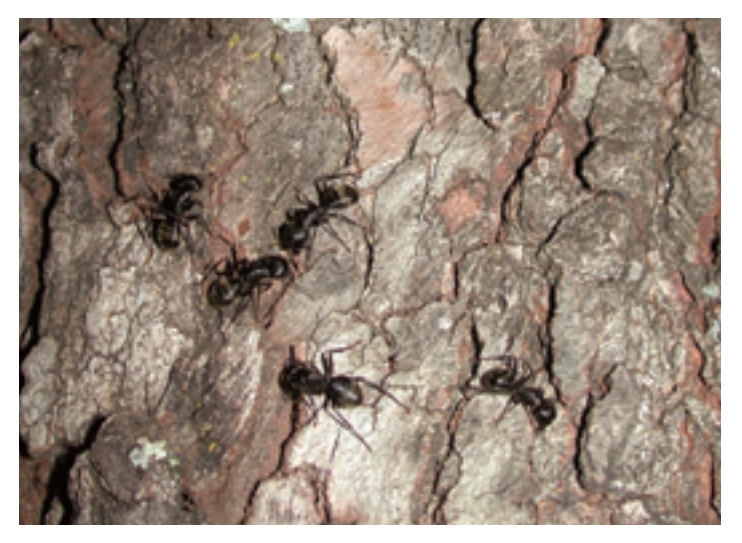
Figure 10. The presence of numerous carpenter ants moving up and down a tree trunk in more or less a single file line is a strong indication of colony presence.

Since carpenter ants use permanent trails, use a flashlight to find ants on the trail and then follow them as they move to and from their nest. Finding just part of the trail can be a tremendous help in finding the nest. After locating several points along a trail a directional pattern will emerge, and often lead directly to the nest. Look for sawdust at the base of trees. Since carpenter ants must excavate wood to expand their galleries, it is common to find piles of sawdust on the ground at the base of a tree where carpenter ants nest (Figure 11). As mentioned previously, carpenter ants do not consume wood but must chew it to build and expand nest galleries. Galleries are created by biting off small pieces of wood and disposing of it to the outside. The small bits of wood often pile up at the base of a tree and take on the appearance of sawdust.