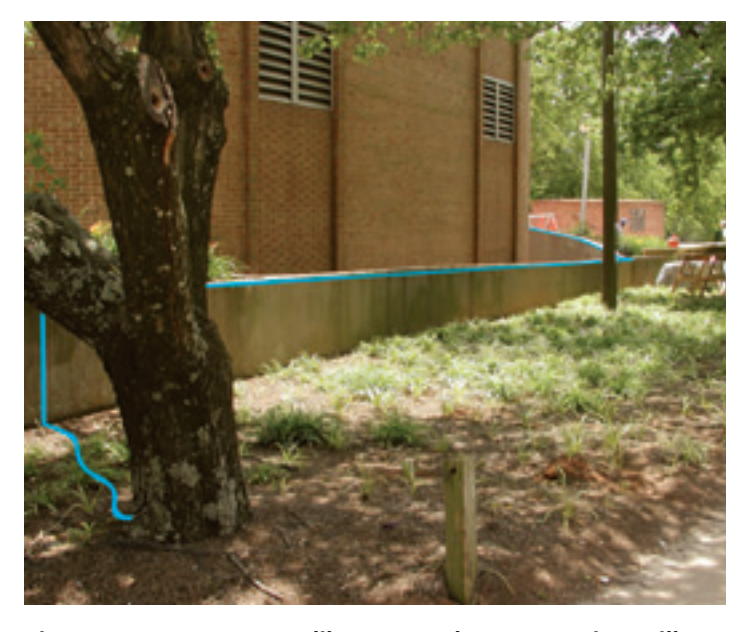
Figure 8. Carpenter ants, like many other ant species, will use existing guidelines such as the edge of this concrete wall (blue line) to forage from nest sites (the tree in this figure) to foraging sites (a garbage can at the end of the blue line).

Outdoors, black carpenter ant nests are found almost exclusively in trees containing treeholes, while the Florida carpenter ant is more opportunistic. It is not only found nesting in trees but also under loose debris found lying on the ground (e.g., roof shingles, cardboard boxes, logs, etc.).