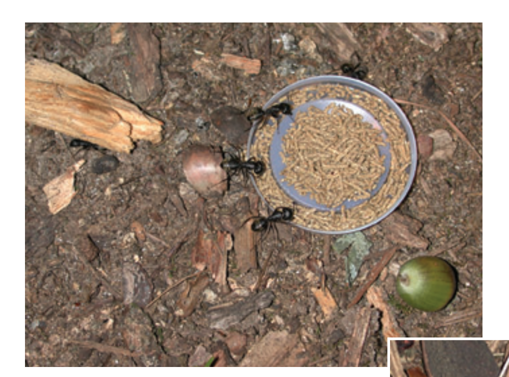
Figure 12. Since carpenter ants rarely deviate from their foraging trail (see Figure 7), baits should be placed next to the trail and as close to the suspected colony location as possible. Baits should be delivered from several points sources and not scattered.