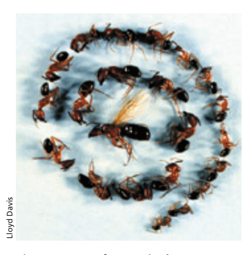
Figure 3. Ants from a single carpenter ant colony vary in size considerably. As such, ant size alone should not be used for identification.

IDENTIFICATION Carpenter ants are the largest of the pest ants found in Georgia. In Georgia, there are two pest species of primary importance, the black carpenter ant ( Camponotus pennsylvanicus ) and the Florida carpenter ant ( Camponotus floridanus ). Black carpenter ants are dull black and their abdomen is covered by yellowish hairs, while the Florida carpenter ant has a deep reddish-colored head and thorax and a shiny black abdomen (Figure 2). Since ants from a single carpenter ant nest vary greatly in size, ant size alone is usually not a good characteristic for identification. Carpenter ants vary in size from about 1/4 to 1/2 inch (Figure 3). To confirm their identity, a few ants should be collected in a small vial filled with a preservative, such as rubbing alcohol, and sent to a Cooperative Extension Service county agent. Look in the white pages under county name for the phone number of the nearest Cooperative Extension Service office.