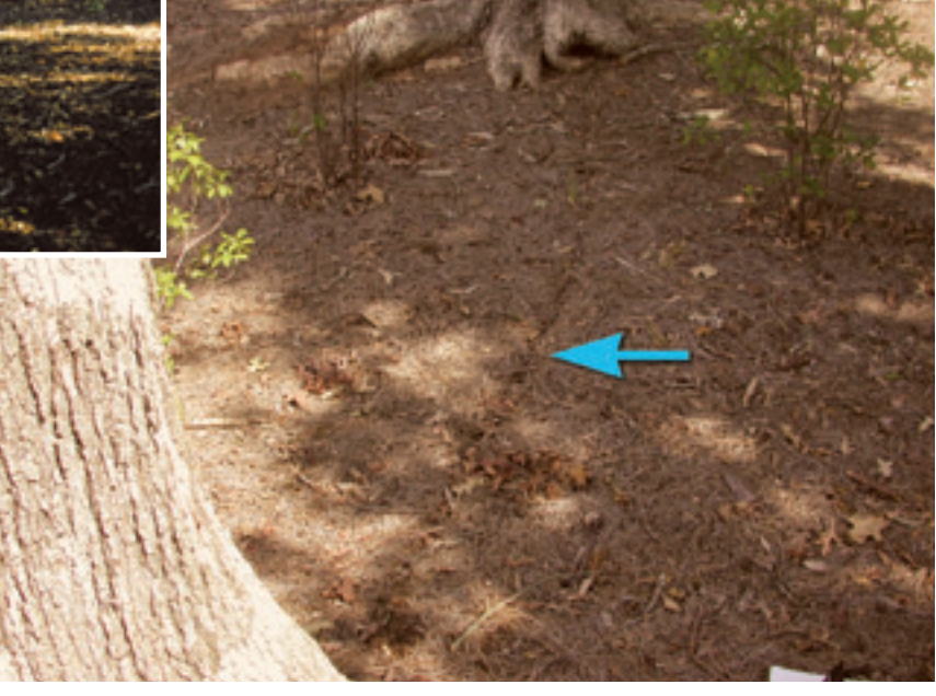
Figure 7. Carpenter ants use well-established, semi-permanent trails (blue arrow) as they move between nest sites and feeding sites, and will even use the same path from one year to the next.

Carpenter ants feed mainly in the tops of trees where they consume the sweet, sugarrich honeydew directly from aphids and scale insects that are found feeding on the tree's sap. Honeydew is nearly pure sugar, and is excreted by aphids and scale insects in large quantities during the spring and summer months. Many ant species depend on honeydew as a stable, predictable source of food throughout the warm season.