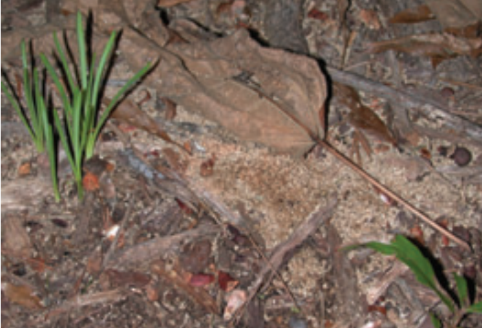
Figure 11. Since carpenter ants do not eat the wood they chew, piles of sawdust-like wood shavings are commonly found at the base of trees where carpenter ants nest.