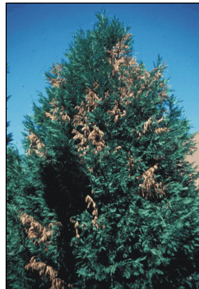
Figure 3. Branch dieback symptoms of Seiridium canker.

Sanitation, such as removal of cankered twigs