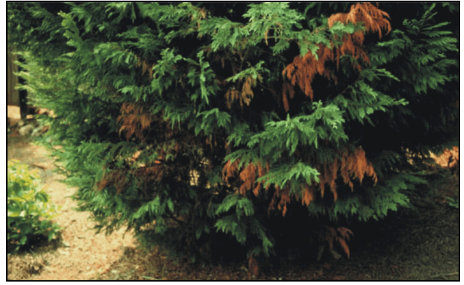
Figure 5. Dark, rust-colored dieback symptoms of Botryosphaeria (Bot) canker. the canker as it grows.

In the landscape, Bot canker symptoms resemble those caused by Seiridium canker. Bright, rust-colored branches and yellowing or browning of shoots or branches are the first observed symptoms. Closer inspection reveals the presence of sunken, girdling cankers at the base of the dead shoot or branch. Sometimes, the main trunk shows cankers that might extend for a foot or more in length. These cankers rarely girdle the trunk, but they will kill branches that may be encompassed by