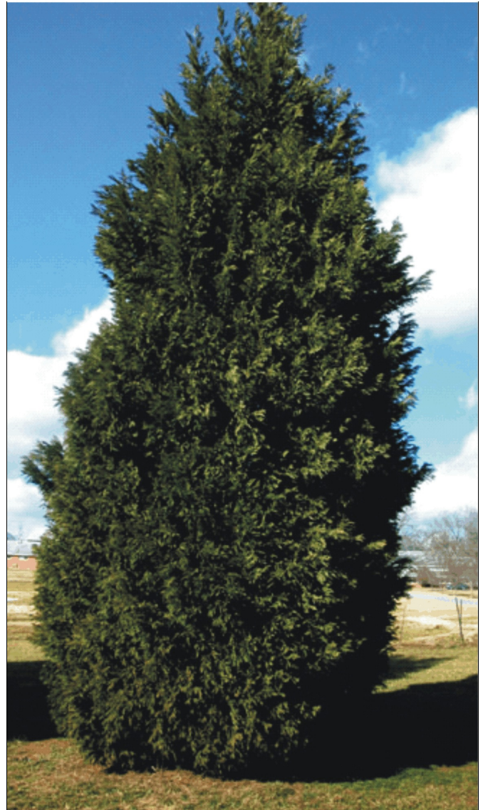
Figure 1. Healthy, mature Leyland cypress.

In Georgia, Seiridium canker is probably the most important and destructive disease on Leyland cypress in the landscape. Although the fungi Seiridium cardinale , Seiridium unicorne , and Seiridium cupressi have been reported to cause disease on Leyland cypress and other needled evergreens, only Seiridium unicorne is most commonly associated with cankers and twig dieback on Ley-