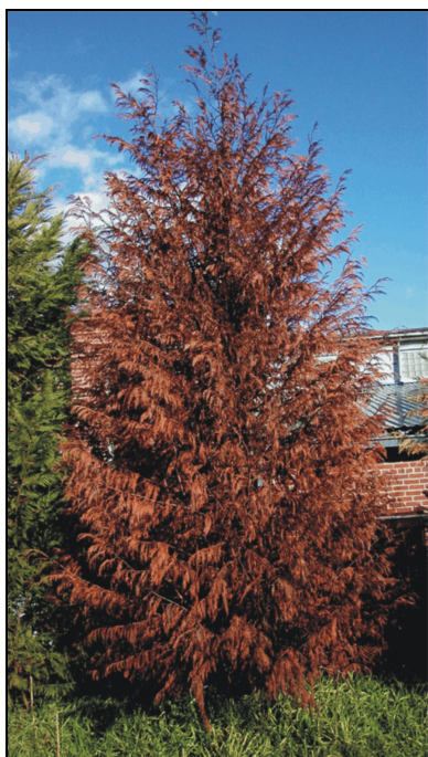
Figure 6. Tree killed by Phytophthora root rot.

There is no effective control once the tree is infected. As a preventive measure, remove the stumps of felled conifers completely or treat the stump surface with borax immediately after the tree is felled.