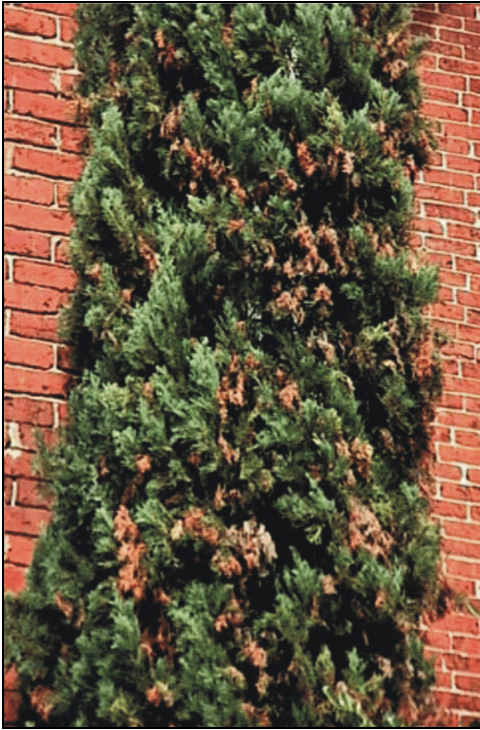
Figure 2. Branch and twig dieback symptoms of Seiridium canker.

oration is most likely to appear in early spring; however, it can be seen at any time of the year. The disease expansion often continues until a significant portion of the tree is destroyed. Upon closer examination, formation of numerous thin, elongated cankers is observed on stems, branches and branch axils. These cankers cause twig and branch dieback. Most of the cankers are slightly sunken, with raised margins, and they may be discolored dark brown to purple. Cracked bark in infected areas is often accompanied by extensive resin exudates that flow down the diseased branches. The cambial tissue beneath oozing sites is discolored with a reddish to brown color.