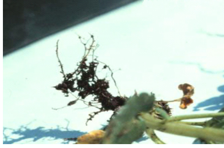
Figure 2. Brown, soft and decayed roots are characteristic of Pythium spp. infection.