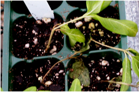
Figure 1. Wilting and damping-off symptoms of Rhizoctonia root rot on annual vinca.