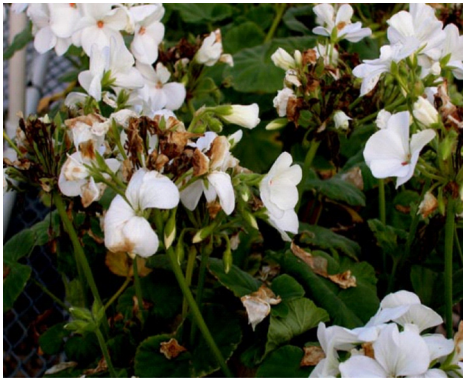
Figure 10. Geranium flowers showing Botrytis blight symptoms.