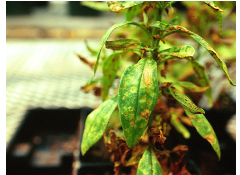
Figure 6. Yellow spots and rust-colored spore pustules of snapdragon rust.