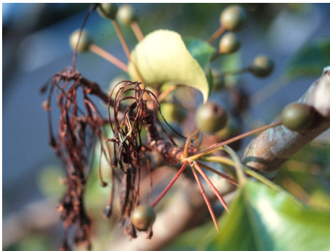
Figure 13. Twig and branch necrosis symptoms of Fireblight.