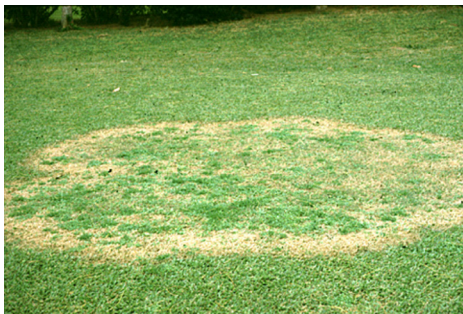
Figure 16. Rhizoctonia solani infection on zoysiagrass.