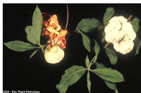
Figure 8. Leaf galls caused by the fungus Exobasidium spp. on azalea.