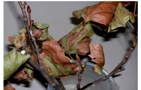
Figure 15. Leaf browning, wilting and curling – symptoms of drought stress.