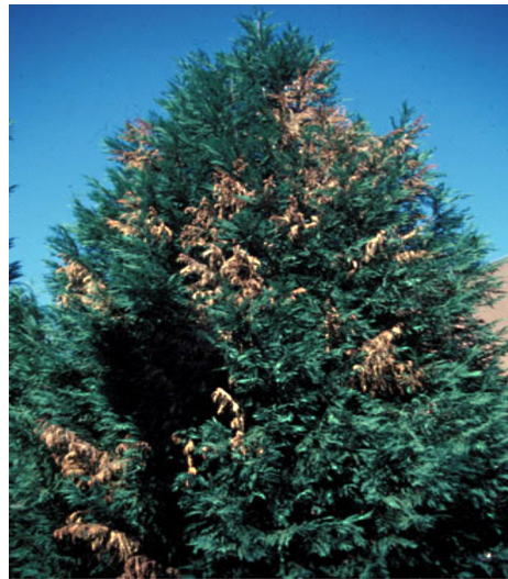
Figure 11. Branch dieback symptoms of Seiridium canker.