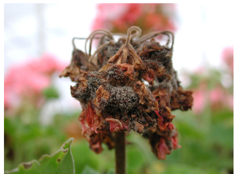
Figure 9. Flower blight caused by Botrytis .