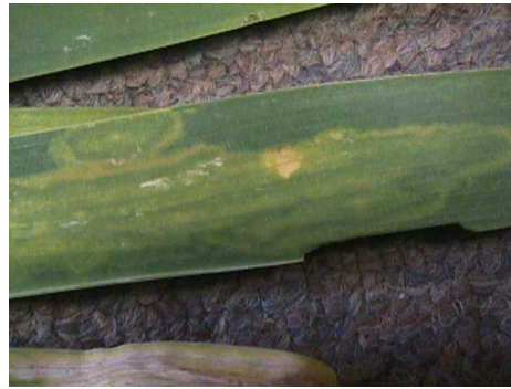
Figure 14. Yellow ringspot pattern on lily leaf.