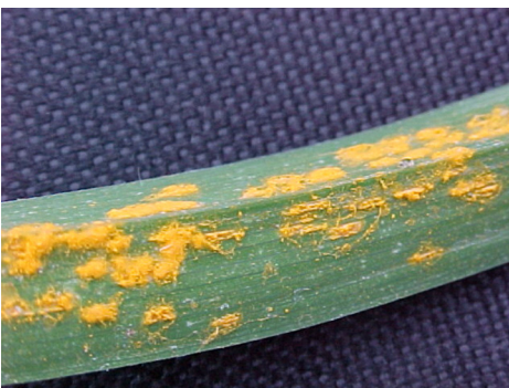
Figure 7. Bright orange rust spores and pustules on the underside of a daylily leaf.