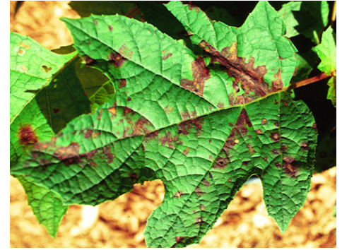
Figure 12. Angular, purplish bacterial leaf spots develop along the leaf veins of an oak-leaf hydrangea.