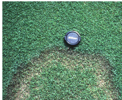
Figure 17. Brown patch ring on bentgrass.