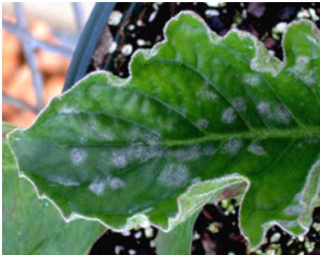
Figure 4. Whitish and gray fungal growth is characteristic of powdery mildew on leaves.