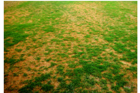
Figure 18. Yellowing and thinning symptoms of melting out.