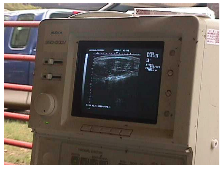
Image 2: The ultrasound machine displays the reflected sound waves as an image on the screen. This is a ribeye image.