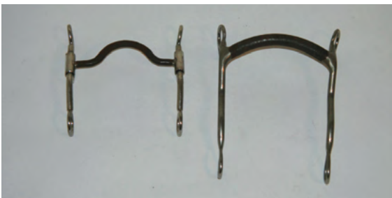
Figure 5. Shank length helps determine bit severity. The bit on the right has a longer shank and therefore more leverage compared to the bit on the left. Additionally, the ratio of shank length below the mouthpiece compared to the length above (purchase length) for the bit on the right is greater, which increases the leverage factor.

Bit Severity: When using a snaffle bit, the main factors that affect severity are diameter and mouthpiece texture. A larger diameter mouthpiece results in the pressure applied to the tongue and bars being diffused over a larger surface area. This makes these bits less severe than a bit with a smaller diameter mouthpiece, which concentrates the pressure into a smaller area.