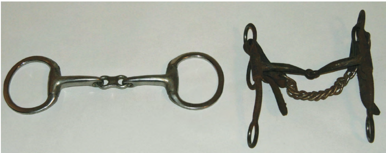
Figure 1. Examples of a commonly seen snaffle bit (left) and curb bit (right). Notice that on the snaffle bit, reins attach directly to the mouthpiece while on the curb bit, reins attach to a shank attached to the mouthpiece.

A snaffle bit may have a solid mouthpiece, a two-piece mouthpiece, a three-piece mouthpiece or multiple links such as a chain. The mouthpiece may or may not have a port, rings, keys, dogbone, etc. The key to identifying a snaffle is that it is a bit that operates off of direct pull; there is no leverage involved. The reins on a snaffle bit attach directly to the mouthpiece, not to a shank.