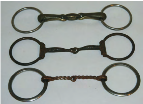
Figure 4. Examples of mouthpieces of different severity. From top to bottom: large diameter mouthpiece (least severe), mouthpiece with smaller diameter (moderate severity), mouthpiece with small diameter and twists (most severe).