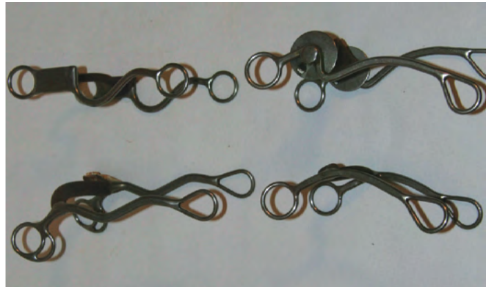
Figure 7. Different styles of shanks on curb bits. Note that the bottom right bit has shanks that rotate independently, but has a controlled range of motion due to a built-in stop.