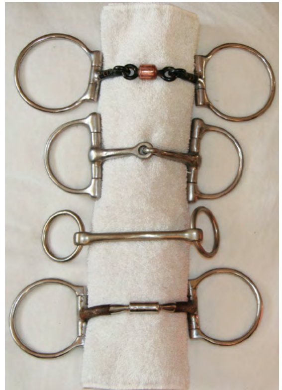
Figure 2. Examples of different snaffle bit mouthpieces. A bit that is broken in more than one location (top) shapes around the tongue, distributing pressure equally over the tongue and bars. A bit that is broken in one place (second from top) places pressure more on the bars of the mouth. A solid bit (second from bottom) places pressure more on the middle of the tongue. A barrel-hinged mouthpiece (bottom) has a limited range of motion.

When choosing a snaffle bit, the ring design must be considered. Snaffle bits typically are available in O-ring, D-ring, egg butt, and full cheek configurations. The rings can vary in size from 2 1/2 in. in diameter to 4 in., with 3 in. being fairly standard. O-ring and egg butt bits are probably the most popular styles. Full cheek bits are also popular, but should always be used with bit keepers for safety reasons; a full cheek bit that is not properly secured with a bit keeper can easily get snagged on surrounding items or injure nearby horses and riders. Full cheek bits and very large-ringed bits are used in some training situations to apply pressure to the side of the horse's face when being asked to yield laterally, thereby encouraging the horse to yield better and also to prevent the bit from being pulled through the mouth.