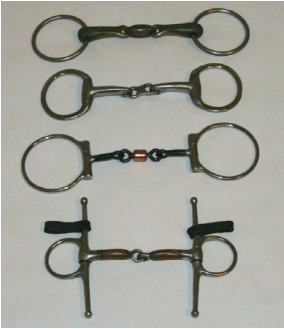
Figure 3. Snaffle bit styles: (from top to bottom) O-ring or loose ring, egg butt, D ring, full cheek with bit keepers.