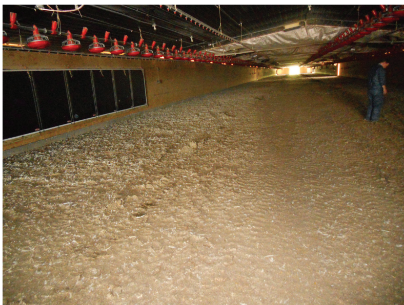
Figures 2 and 3. Chopped giant miscanthus (Figure 2) used as bedding in a broiler poultry house (Figure 3).