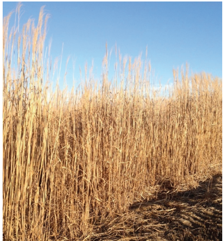
Figure 1. Field with 9-foot-high mature giant miscanthus grass.

GMG is considered to be an energy crop. It grows rapidly and has low mineral content and a potentially high biomass yield. It can be harvested dry, baled, and stored under cover. If it is baled for conversion to biofuels, the resulting CO 2 emissions are equal to the amount of CO 2 the plant takes from the atmosphere to grow, so it is considered a greenhouse-gas-neutral bio-plant. The grass can be used as a biomass crop for bioenergy, thermo-conversion to bio-oil as crude for diesel fuel, as feedstock for cellulosic ethanol, and as bedding for livestock. It has excellent water-holding capacity and has been tested as an alternative to pine shavings as poultry bedding.