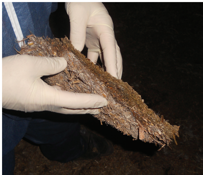
Figures 5 and 6. Caking of pine shaving (Figure 5) and caking of GMG (Figure 6).

Poultry litter is a valuable by-product of the poultry industry and is used by crop producers as a soil amendment both for its nutrient quality and humus. After several flocks have been grown on the bedding, the nutrient content of poultry litter is approximately a 3-3-2 grade fertilizer. On a per ton basis, this equates to a total of 60 lb nitrogen, 78 lb phosphate, and 56 lb potassium. From the studies conducted in Georgia, it was observed that there were differences between the GMG and pine shavings bedding in nitrogen content after one flock was grown. The difference between the amounts of phosphorus and potassium in the two bedding materials was small. (Figure 7).