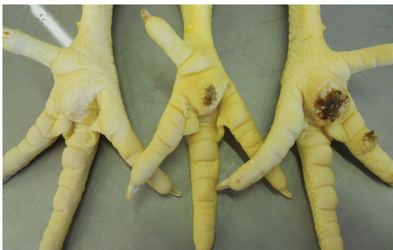
Figure 4. Paw scores from 0 to 2.