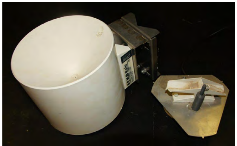
Figure 7. Tipping bucket rain gauge. The right part of the picture shows the two tipping spoons used for measurement.

As an alternative to using ET to determine irrigation needs, a variety of soil moisture sensors have been developed that can be integrated into weather stations that directly measure soil moisture. The three most common types of soil moisture probes used are time domain reflector (TDR), time domain transmission (TDT), and amplitude domain reflectometer. In all cases, sensors measure the volumetric water content (VWC), or the percent of a soil column that is occupied by water. For a detailed description of soil moisture sensors, refer to “Understanding Soil Moisture Sensors: A Fact Sheet for Irrigation Professionals in Virginia” by Virginia Tech Extension specialists David Sample, James Owen, Jeb Fields, and Stefani Barlow.