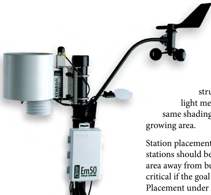
Figure 1. Weather station including a rain gauge, light sensor, anemometer, leaf wetness sensor, and temperature/relative humidity sensor enclosed in a radiation shield.*

Station placement is critical for accurate measurements. Weather stations should be installed in the growing environment in a flat area away from buildings, pavement, and trees. This is especially critical if the goal of measurements is to warn of impending frost. Placement under a tree or near a structure could alter measurements. Greenhouse structures can also impact measurements, especially light measurements, but plants would also be exposed to the same shading. The key is to place weather station equipment in the growing area.