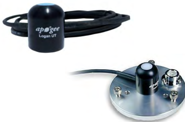
Figure 2. Photosynthetically active radiation (PAR) sensors (left) measure the light that is used by plants for photosynthesis. Pyranometers (right) measure shortwave radiation, which is the total incoming solar radiation.*