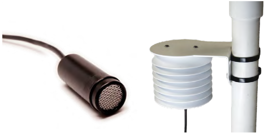
Figure 3. Relative humidity and temperature sensors (left) need to be enclosed in a radiation shield (right) to provide accurate measurements.*

Vapor pressure deficit: The difference between saturation vapor pressure and vapor pressure (expressed in pressure units such as kPa).