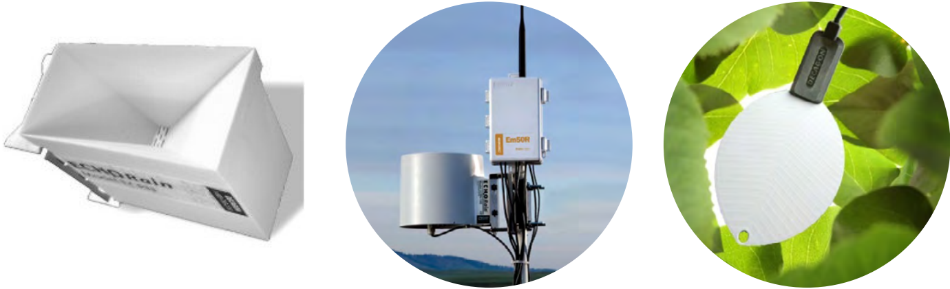
Figure 6. Rain gauges (left and middle) are necessary for measuring the actual amount of rainfall, which affects how much irrigation is needed. Leaf wetness sensors (right) measure leaf surface or canopy moisture and can be useful in predicting plant diseases.*

Leaf wetness sensors can measure canopy or leaf surface moisture and can be used to predict plant disease by the duration of canopy/leaf wetness. Growers can also use the measurements to determine when to irrigate crops that are prone to foliar diseases or when to apply fungicides or bactericides based upon rainfall and dew duration.