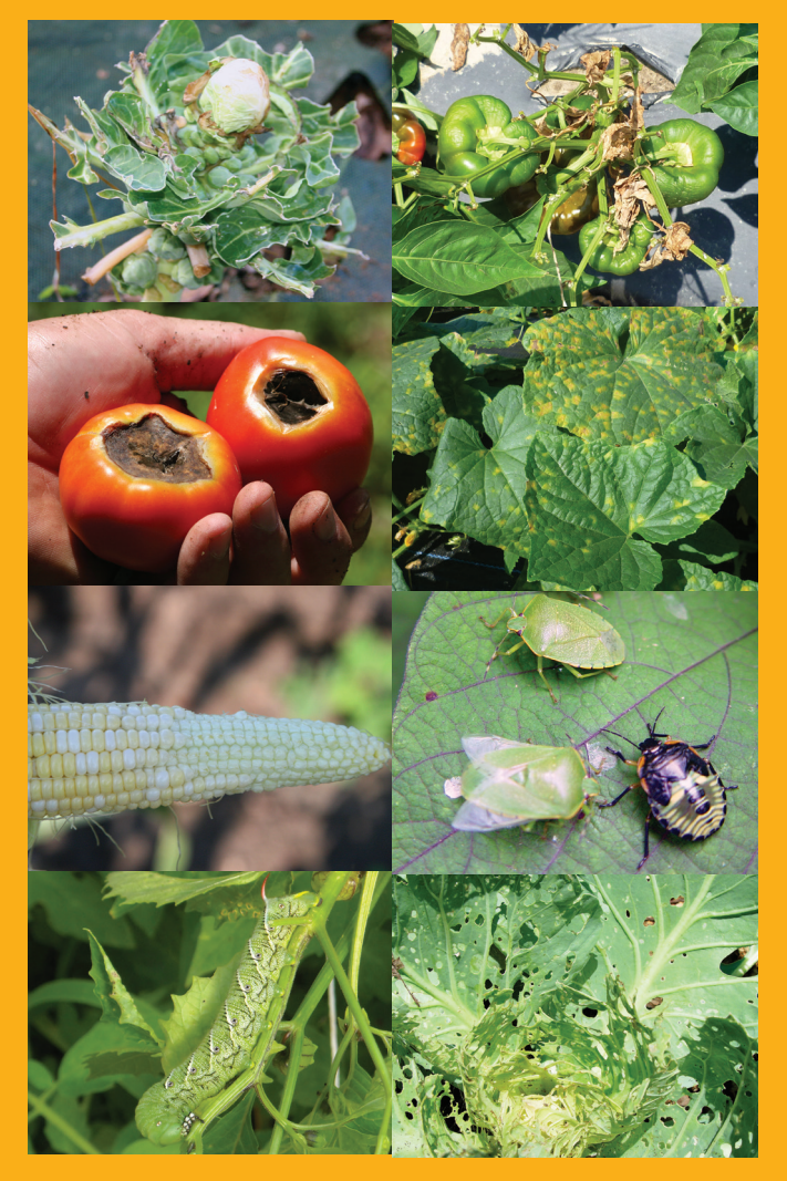
A pictorial guide to the common cultural, insect and disease issues with management tips.