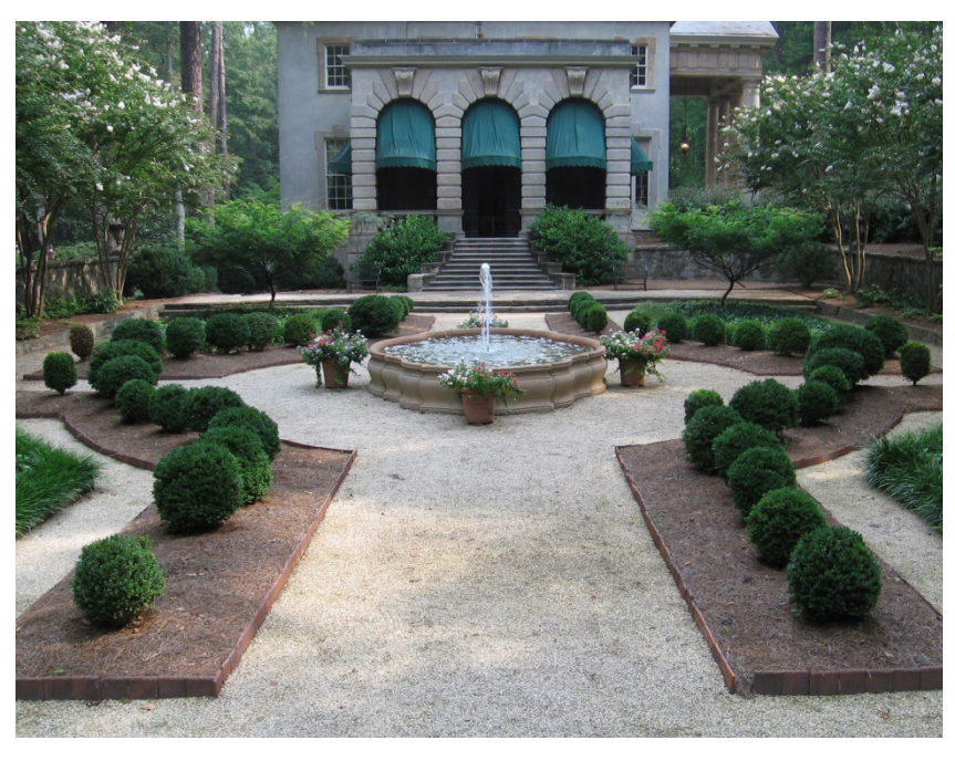
Figure 1. Boxwood plantings are a staple element of many formal gardens. Pictured is a heritage garden at the Atlanta History Center.

Gardeners have sculpted boxwood hedges and topiaries into every shape imaginable, making the boxwood a cornerstone of tradition in the formal garden (Figure 1). With the dreaded spread of boxwood blight disease to U.S. gardens, this tradition may begin to take a turn. The disease was identified in Europe a decade ago and was observed