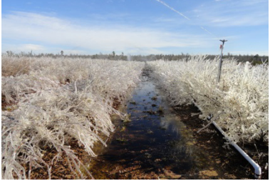
Figure 1. An active frost protection system operates over southern highbush blueberry.

If your system is drawing irrigation water from a well, this would be a great time to inspect your well head, test discharge, and inspect electrical wires and boxes (Figure 3).