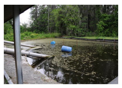
Figure 2. Inlet pipes run from irrigation ponds. Note the blue barrels that are keeping the ends of the pipe from sitting on the bottom of the pond.