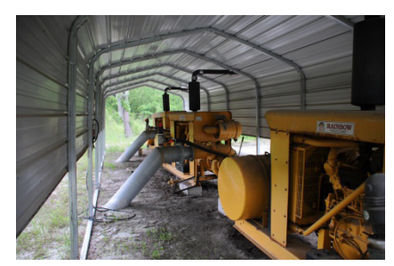
Figure 5. Diesel-powered prime movers for irrigation pumps.

If the power units are gasoline engines, inspect spark plugs, wires, and distributor caps. Clean and measure the plug gap, look for cracks in the wires and distributor cap, look for pitting of the rotor, and if the distributor has points, inspect for pitting, proper gap, and timing. Make inspections of the wiring, clean battery terminal posts, and look under enclosures for critter activity. Replace all damaged and worn parts. Fill fuel tanks.