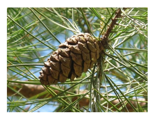
Figure 2: Shortleaf pine needles (left image). Shortleaf bark, with circular resin pockets (middle). Shortleaf cones (right).

cone crops happen every 3–6 years in the southern and western areas of its range; and 3–10 years in the northern and eastern areas. Overall, poor, irregular seed crops are common for shortleaf pine. Seedfall begins in late October to early November with a majority of the seed falling 75 to 150 feet from the tree. Each of the small cones contains 25–30 seed. A tree may have 130 cones in a good year.