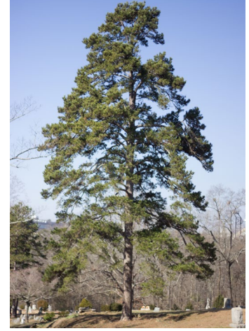
Figure 5: Shortleaf as an attractive landscape specimen at a Georgia site.

Shortleaf is the favored pine of the southern pine beetle, in part because its low resin flow cannot expel invading beetles. Shortleaf pine is resistant to fusiform rust a common problem of loblolly and slash pine plantations. Littleleaf disease is a serious threat to shortleaf that reduces growth rates and causes mortality. Shortleaf has the lowest risk to ice storms damage of the major southern pines.