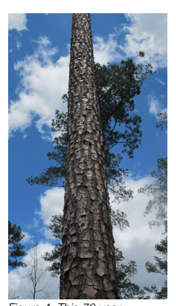
Figure 4: This 70 year old shortleaf depicts the straightness, taper, small branches, and slow growth desired for top grade lumber.

Shortleaf pine is a valued timber tree. Its wood quality, including the juvenile wood, is superior to loblolly pine. The qualities required for high grade sawtimber include; straightness, low taper, high wood density, small branches, high proportion of latewood, and no fewer than 4 growth rings in the last inch of radial growth.1,12 At age 40 the proportion of high-value pole size timber may be as high as 40 percent. Most studies have documented that loblolly pine has 10-15 point site quality index (base 50) advantage over shortleaf pine. However, Harrington reported the difference