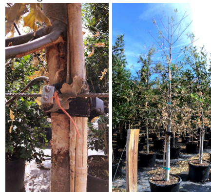
Left: Close up of bark and cambium damage resulting from support system movement. Right: Near complete defoliation and canopy death as a result of the damage.