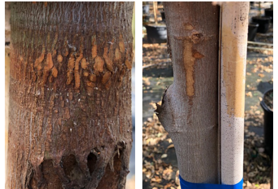
Figure 5. Incomplete (initial) trunk damage due to a strap/wire support system (top) and bamboo staking (bottom).

In both of these cases, there is no noticeable effect currently (two weeks after the event) but damage will likely become apparent in the following growing season.