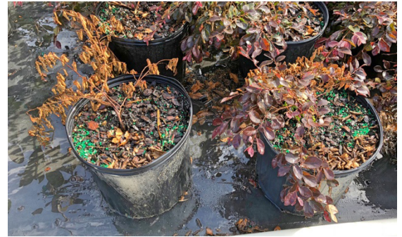
Figure 4. Crown damage at or below soil line.

The plant on the left has died due to the stem breaking below the soil line, whereas the plant on the right still appears healthy, although it is misshapen due to wind. With time, the plant on the right may also decline for the same reason.