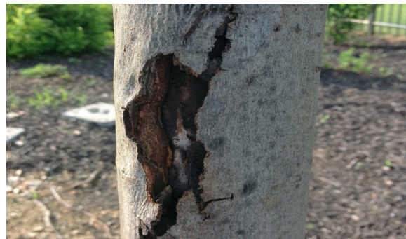
Figure 7. Winter injury following new growth (caused by defoliation during a late season hurricane) is not relegated to the tender new growth.

Often, fluids in the trunk flash-freeze, causing the vascular tissues to swell and burst as ice forms. The result is major damage to the trunk, which is not seen for six to 12 months after the injury occurs. In the case of this photo, the damage occurred in the fall following Hurricane Sandy and became apparent the following June.