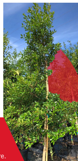
Figure 3. Stem breakage such as this secondary ilex stem (right) result in misshapen canopies (left) that require major pruning to rehabilitate.