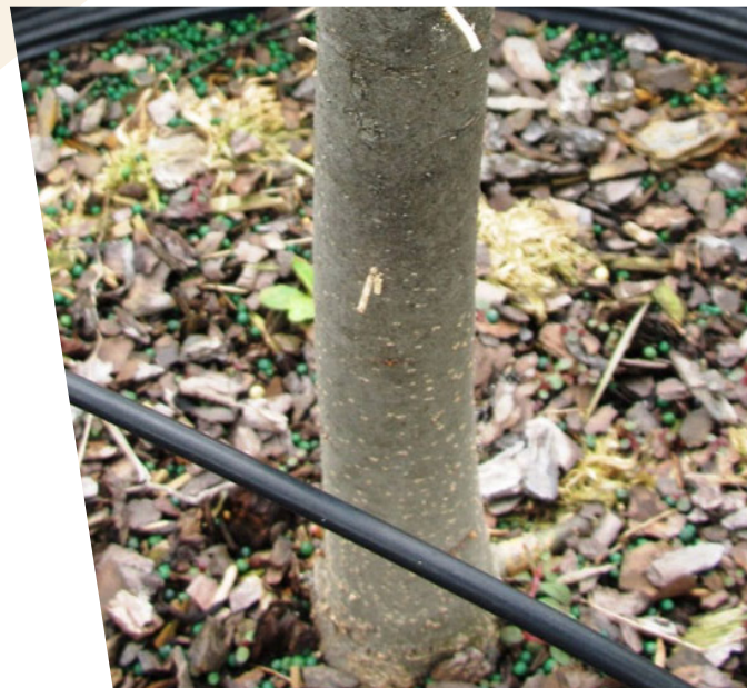
Figure 6. Secondary pathogen infection and insect infections due to root and stem damage.

In this case, a plant-volatile chemical (ethylene) is produced by the plant when it receives damage to stems and/or foliage. Granulate ambrosia beetle is attracted to ethylene and burrows into the stem of the tree, causing primary structural damage and transmitting vascular pathogens that cause disease and can ultimately cause plant mortality. This photo was taken in spring 2018 on nursery stock damaged by Hurricane Irma.