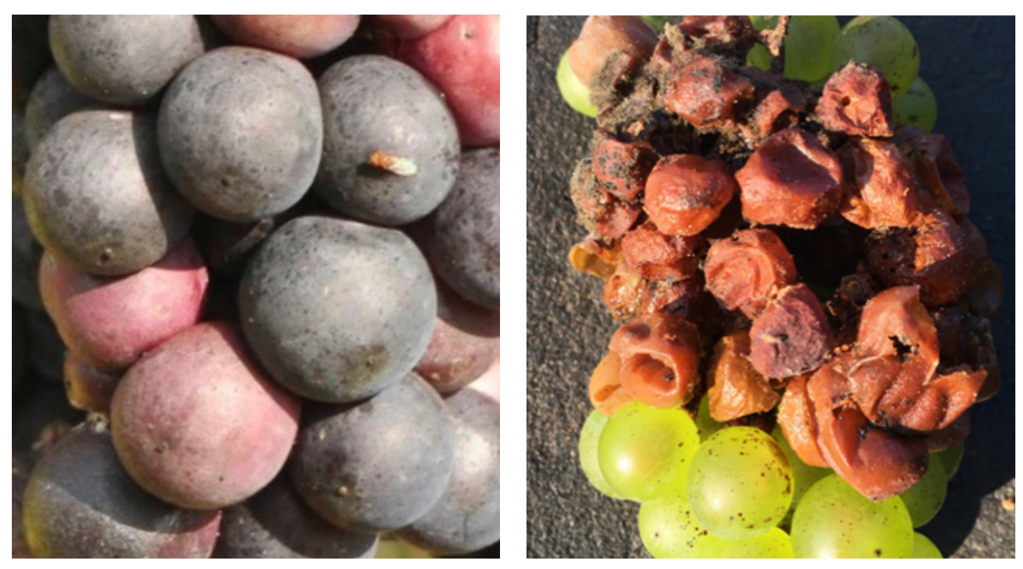
Figure 1. Drosophila species (left) and Botrytis bunch rot (right) on sour rot infected clusters. Note the fungal growth, which is not part of the sour rot complex but exacerbates the damage.

The mechanism of infection and role that multiple causal organisms play in sour rot etiology are not fully understood. However, grape sour rot has been described by Hall et al. (2018a) as a disease that only exists in the presence of damaged fruit, ethanol-producing yeast ( Metschnikowia species, Pichia species, and Saccharomyces sp.), acetic acid bacteria ( Acetobacter sp. and Gluconobacter species) (AAB), and Drosophila species (fruit flies). Sour rot infections appear to be a function of AAB, yeast, and fruit flies on damaged grape berries that encourages disease progression throughout the entire cluster as ripening progresses. Secondary or simultaneous invasion from fungal pathogens like Botrytis cinerea can be observed in sour-rotted clusters (Figure 1).