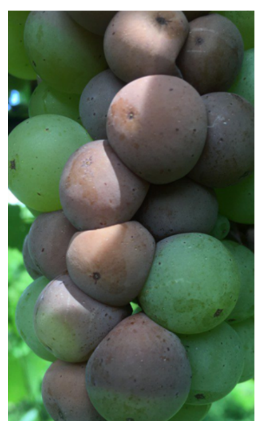
Figure 3. Sour rot infection early in ripening (~15 Brix).