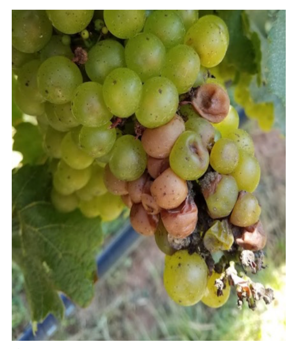
Figure 5. Sour rot symptoms on 'Chardonnay'. Sour rot can manifest as browned berries with no fungal infections (left), but the vinegar smell is diagnostic of this rot complex.