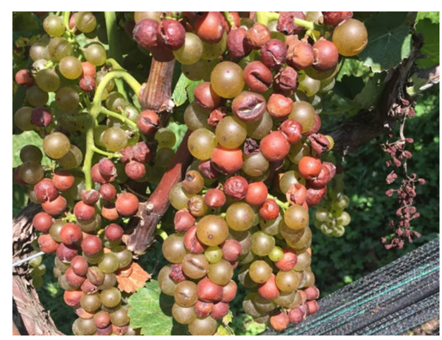
Figure 4. 'Vidal blanc' with damaged skins and sour rot symptoms.

Barata et al. (2012) has suggested that damage to berries allows sour rot to initiate. The causal agent of the damage is not relevant to sour rot, but any damage results in exploitation of the berry pulp by fruit flies, AAB, and yeast. Fruit flies are attracted to the damaged berries, and thus act as vectors that transport AAB and yeast to injury sites in unaffected fruit clusters (Barata et al. , 2012). Sour rot is then initiated through uncontrolled fermentation of the berry juice into ethanol. Ethanol is oxidized by AAB into acetic acid, which then turns the fruit shades of brown and causes the pulp to liquefy and emit a sour vinegar aroma, giving the disease its name. In fact, the smell of vinegar permeates the air and is indicative of sour rot. Damaged and rotting fruit attract more fruit flies that continue the cycle by spreading the AAB and yeast to unaffected fruit. The fermented pulp can also ooze and drip onto the other berries within the cluster, spreading the infection to previously undamaged berries. Sour rot can be visually distinctive, with deflated tan to brown berries and no obvious fungal structures (Figure 4 and Figure 5), though the disease can often coincide with Botrytis bunch rot infections (Figure 1). Sour rot can resemble sunscald, but the scent of acetic acid is a diagnostic key to identifying this disease complex.