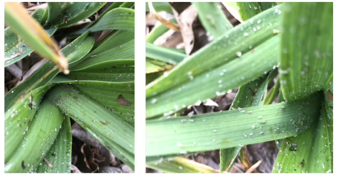
Figure 2. Aphids on daylily plants in the spring. Adults and nymphs can be seen co-existing in the whorls of the developing leaves of daylilies.