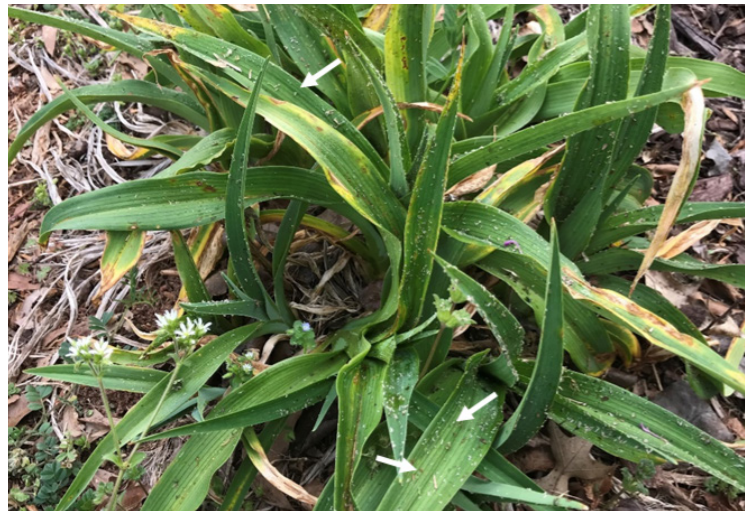
Figure 5. Nymphs shed old white skins on the leaves of a daylily plant (white arrows). The leaves turn yellow and brown after aphid feeding.

If aphid populations are severe, it's advisable to spray with insecticidal soap solution or horticultural oil to suppress the population.