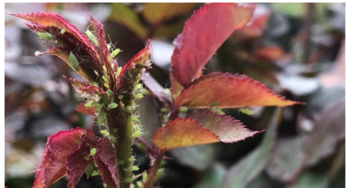
Figure 3. Aphids on rose plants in the spring.