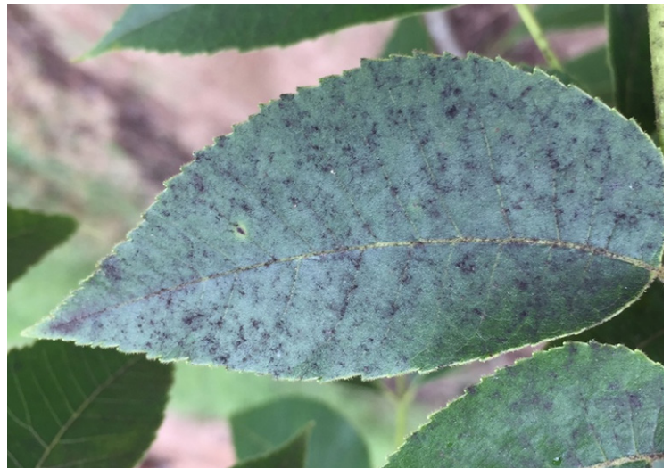
Figure 6. Black sooty mold fungal growth on the surface of a leaf.