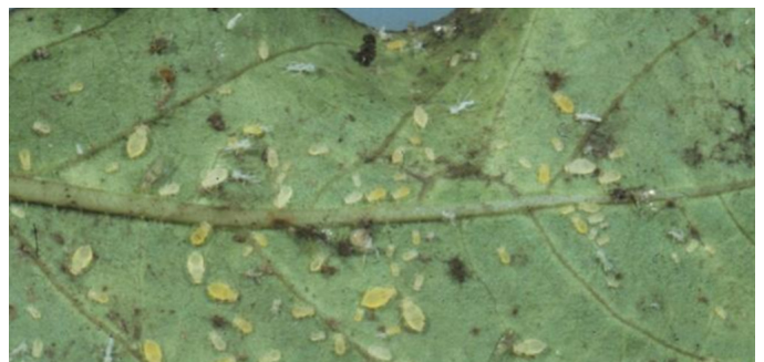
Figure 4. Aphids on a crape myrtle.