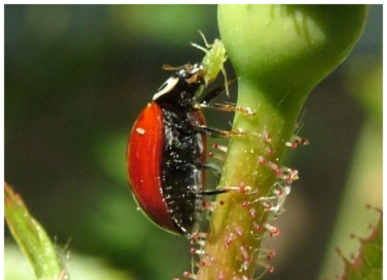
Figure 7. Lady beetle feeding on an aphid.