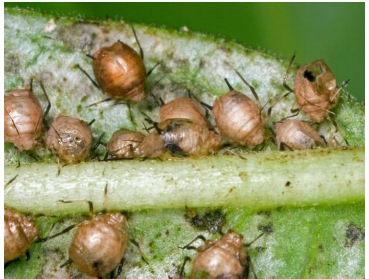
Figure 8. Parasitized oleander aphids, commonly referred to as mummies.

However, repeated applications often are necessary. Insecticidal soap solution or horticultural oil is effective only when applied directly onto the aphids. Because aphids colonize at the bases of leaves (including the unopened whorls of developing new leaves) in most cases, it's essential to fully cover them with contact insecticide. Systemic insecticides also are effective against aphids. Carefully follow the instructions provided on the insecticide label before using the insecticide—the label is the law. These insecticides also can negatively affect beneficial insects—such as the previously mentioned natural enemies and visiting pollinators. Contact your county Extension office for recommendations regarding insecticides.