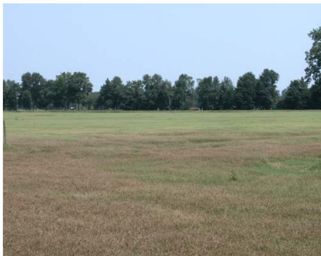
Figure 1. Alicia bermudagrass infected with Helminthosporium in Lowndes County, Georgia. Infected areas appear "bronzed" or red.

the most prevalent adverse factors affecting forages. Bermudagrass leaf spot is a disease that decreases yields, nutritive value and palatability. Bermudagrass leaf spot is caused by a fungus from the genus Helminthosporium and the disease has been informally called Helminthosporium leaf spot, Helminthosporium leaf blotch, or Leaf Blight. Recently, the genus Helminthosporium has been taxonomically reclassified into Cochliobolus (anamorph Bipolaris ) and Pyrenophora (anamorph Dreschlera ). Bipolaris cynodontis has been suggested as the probable causal agent of the disease. For identification and training purposes it continues to be known and informally named as Helminthosporium .