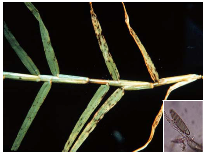
Figure 2. Helminthosporium symptoms on bermudagrass. Inset shows closeup of conidiophores.

Several environmental and biotic factors can reduce yield and quality of forage crops. Diseases are by far