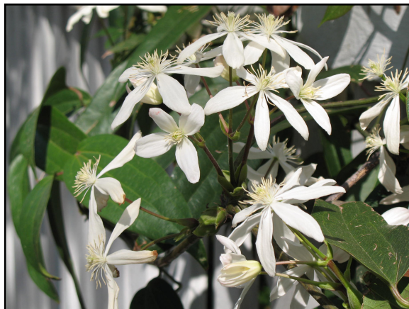
Online Plant Guide