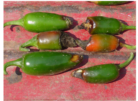
Figure 7. Blossom-end rot of jalapeno pepper.