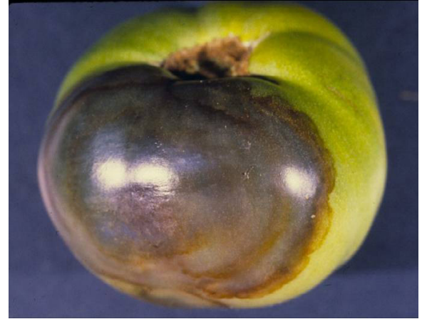
D. Langston, UGA

There are only a few common fruit disorders resembling BER that can lead to an incorrect diagnosis of the problem. Fruit anthracnose may occur on pepper and tomato fruit, but only on the side walls. The same is true for sunscald, which appears on pepper fruit sidewalls and is pale in color. Buckeye rot, caused by Phytophthora , and cucumber mosaic virus (CMV) also resemble BER, but these disorders occur more infrequently than anthracnose. Blossom-end rot is uniformly dark brown and black in color, and appears ONLY on either the lower fruit sidewall or the blossom end of smaller and developing fruit. Often, symptoms will occur as far as 1/3 to halfway up the fruit, but will NEVER start at the stem (calyx) end. Also, BER symptoms will tend to appear during the first fruit set as, early on, growers are unaware of the problem until it's too late. If these symptoms all correspond, the fruit has BER.