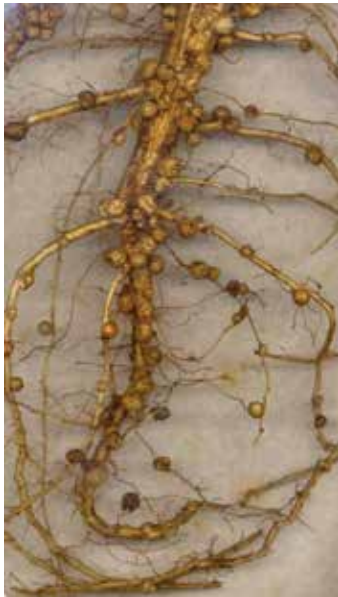
These soybean roots have nodules containing rhizobia that fix nitrogen for plant use.

The best example of a biofertilizer is the rhizobia discussed above that work with legumes such as clover, peas and beans. Each legume has a specific rhizobacteria that works best with that plant. Inoculating the legume seed with the correct bacteria ensures the legume will maximize nitrogen availability if nitrogen in the soil is low. This is particularly important if you have not planted the legume species before, because the correct bacteria may not be present in the soil.