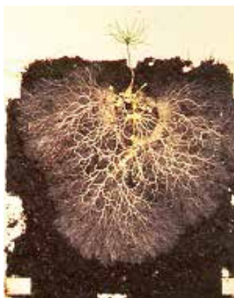
These pine seedling roots are infected with mycorrhizal fungi that allow the plant to obtain nutrients from a bigger volume of soil. (David Read, Oregon State University)

Interest in soil inoculants has grown with an increased recognition that soil biology plays an important part in crop production. Inoculants are used for a variety of reasons. In some cases, we add soil organisms that have a known beneficial effect. For example, rhizobia, a type of bacteria, form a symbiotic relationship with legumes. A symbiotic relationship is one that is mutually beneficial. In return for the plant feeding the rhizobia carbon from photosynthesis and giving it a home, the bacteria can “fix” atmospheric nitrogen into a form that the plant can use. Some fungi, like mycorrhizae, also form a symbiotic relationship with plants, scavenging phosphorus and other nutrients for the plant to use. Other bacteria and fungi do not form a symbiotic relationship with plants, but when added to soil, can promote plant growth, suppress plant pathogens or both.