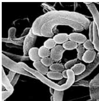
Microscopic actinomycetes in the soil. Some of these microorganisms produce antibiotics.

Soil biology is important for keeping agricultural systems healthy and productive. Living soil is complex. It includes creatures that cannot be seen with the naked eye, such as bacteria, fungi, actinomycetes, protozoa and nematodes, as well as creatures such as insects and earthworms. This community of organisms is bound together in a food web that affects the soil's chemical and physical properties. We care about these properties because they also affect plant growth and health.